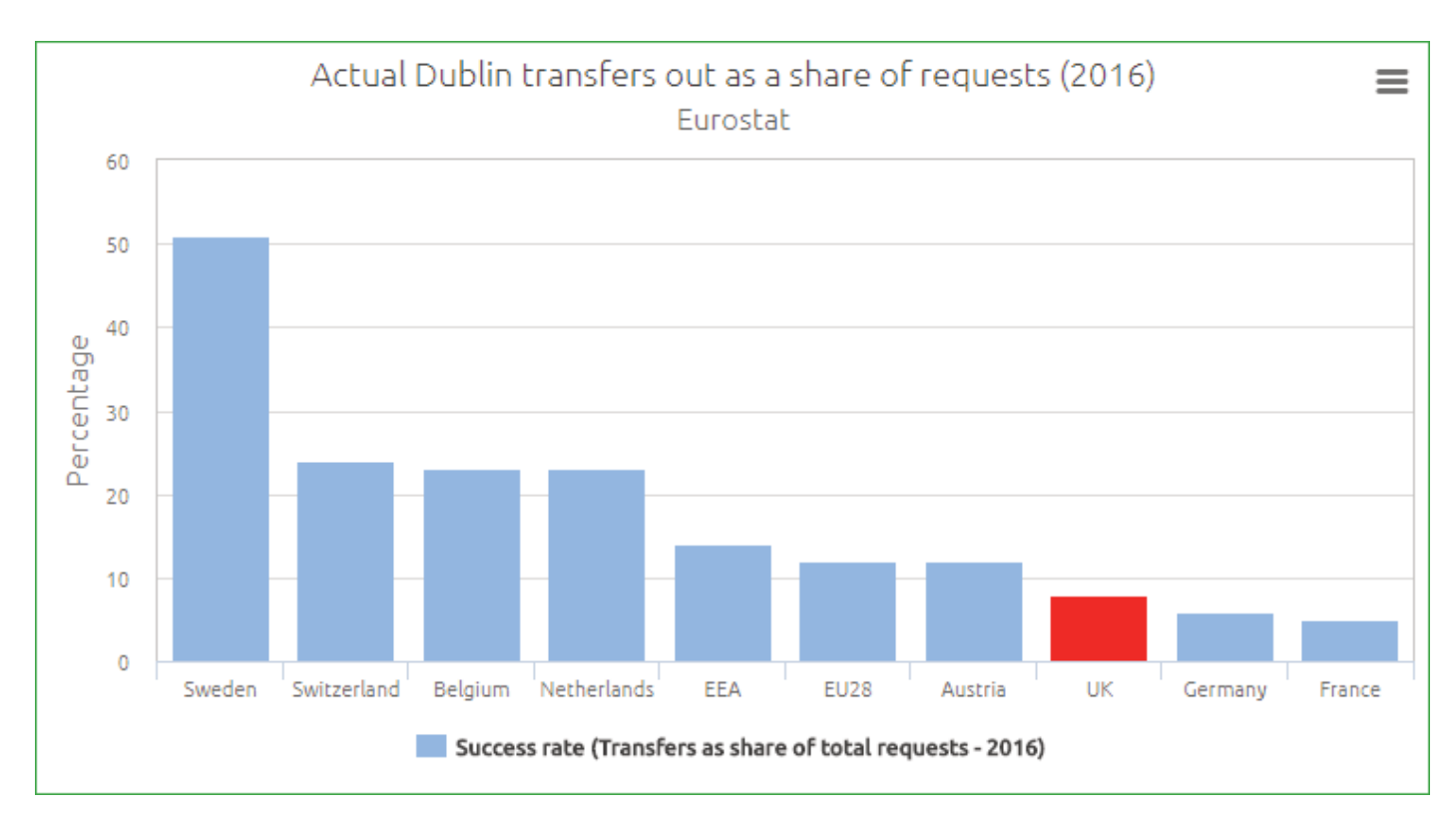
Figure 3: Actual Dublin transfers out as a share of requests (2016) Eurostat.

7. Meanwhile, Eurostat figures enclosed in a recent Parliamentary Answer revealed that a number of other EU and EEA countries appeared to be much more successful than the UK in having their transfer requests actioned in 2016, as figure 3 below shows.