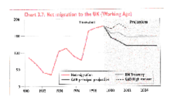
Click here to view larger version

In "Prospects for trend growth" issued with the 2002 budget they published the following chart. Unlike the other two projections above, it includes EU nationals but it excludes dependants and only applies to migrants of working age. It is, however, further evidence of the substantial scale of legal migration which can now be expected.